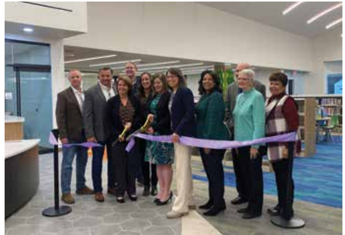
New opening of Avon Library/Ribbon Cutting of Avon Library