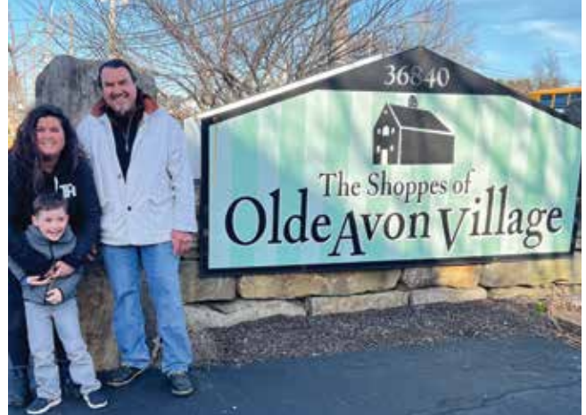
Three generations of Larsons

When you shop at Avon Village, you are supporting the community. All 14 stores are locally owned and