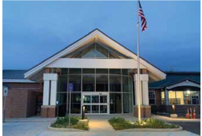
Exterior of the renovated Avon Library

Patrons can sign up for any of the free programs for all ages at LorainPublicLibrary.org/events .