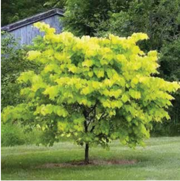
Hearts of Gold Redbud Tree