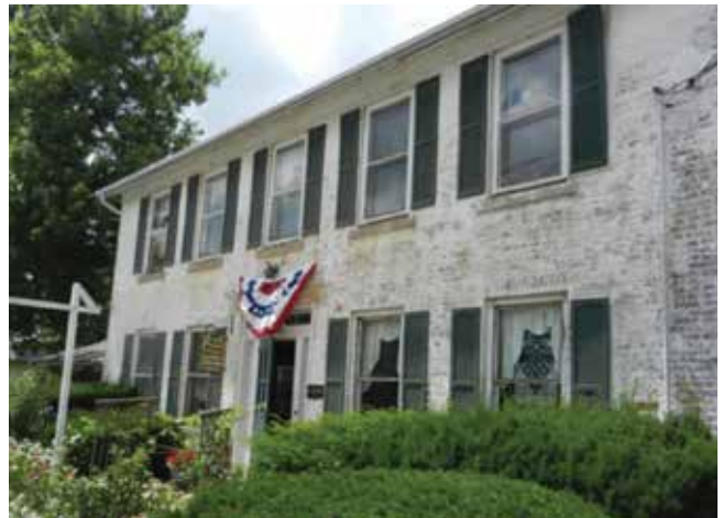
Tree House Gallery and Tea Room