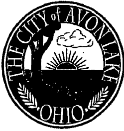
EXHIBIT A RESOLUTION NO. R-27-17