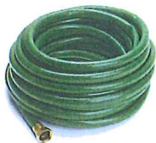
ROPES, CHAINS, CORDAGE, GARDEN HOSES