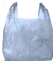
PLASTIC SHOPPING BAGS