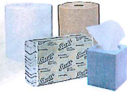
TISSUES, PAPER TOWELS OR NAPKINS